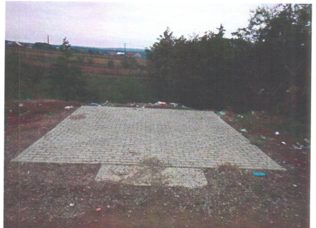
Latitude: N 47°44.042' (47°44'2.5"), Longitude: E 26°11.214' (26°11'12.8"), Altitude (Barometer): 216.00m