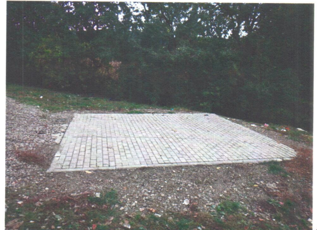
Latitude: N 47°43.834' (47°43'50.0"), Longitude: E 26°11.153' (26°11'9.2"), Altitude (Barometer): 226.00m