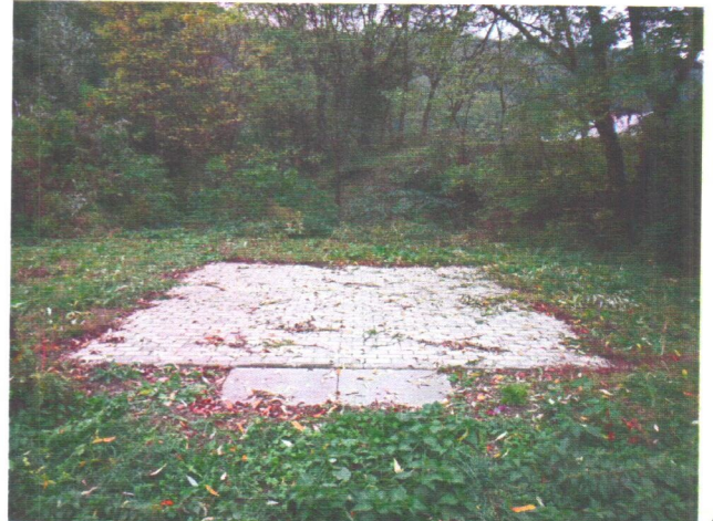
Latitude: N 47°43.217' (47°43'13.0"), Longitude: E 26°11.581' (26°11'34.8"), Altitude (Barometer): 169.00m