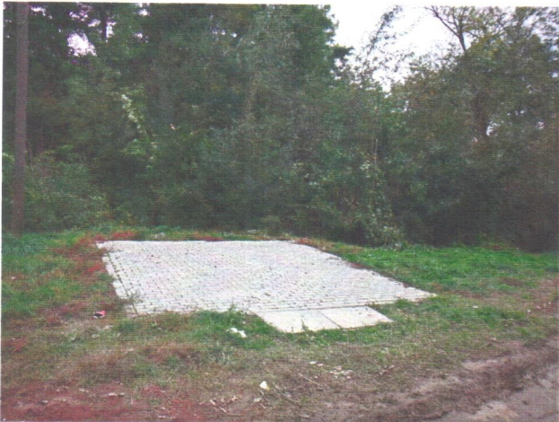
Latitude: N 47°43.744' (47°43'44.6"), Longitude: E 26°11.508' (26°11'30.5"), Altitude (Barometer): 217.00m