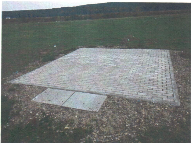
Latitude: N 47°44.398' (47°44'23.9"), Longitude: E 26°11.394' (26°11'23.6"), Altitude (Barometer): 241.00m