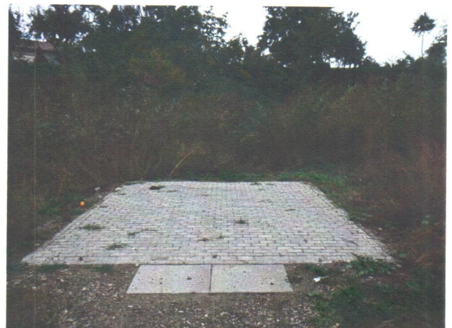
Latitude: N 47°43.450' (47°43'27.0"), Longitude: E 26°11.225' (26°11'13.5"), Altitude (Barometer): 227.00m