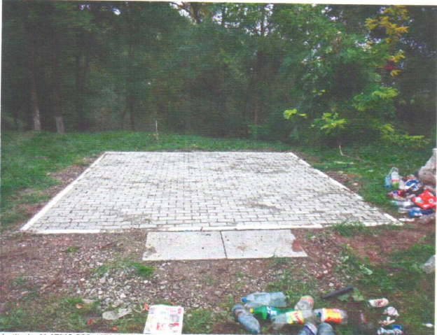
Latitude: N 47°43.329' (47°43'19.7"), Longitude: E 26°11.008' (26°11'0.5"), Altitude (Barometer): 188.00m