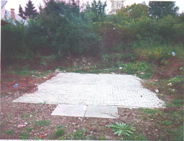
Latitude: N 47°43.006' (47°43'0.4"), Longitude: E 26°11.362' (26°11'21.7"), Altitude (Barometer): 219.00m