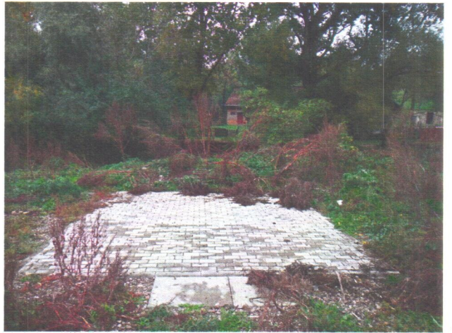
Latitude: N 47°36.167' (47°36'10.0"), Longitude: E 26°3.442' (26°3'26.5"), Altitude (Barometer): 319.00m