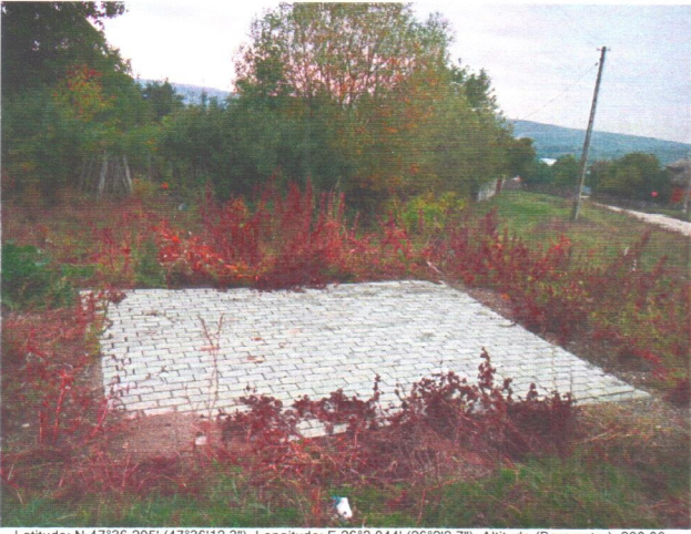
Latitude: N 47°36.205' (47°36'12.3"), Longitude: E 26°2.044' (26°2'2.7"), Altitude (Barometer): 390.00m