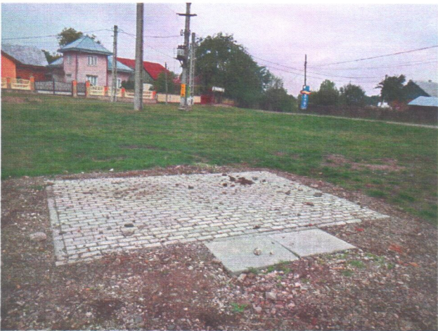
Latitude: N 47°37.716' (47°37'42.9"), Longitude: E 26°2.968' (26°2'58.1"), Altitude (Barometer): 365.00m