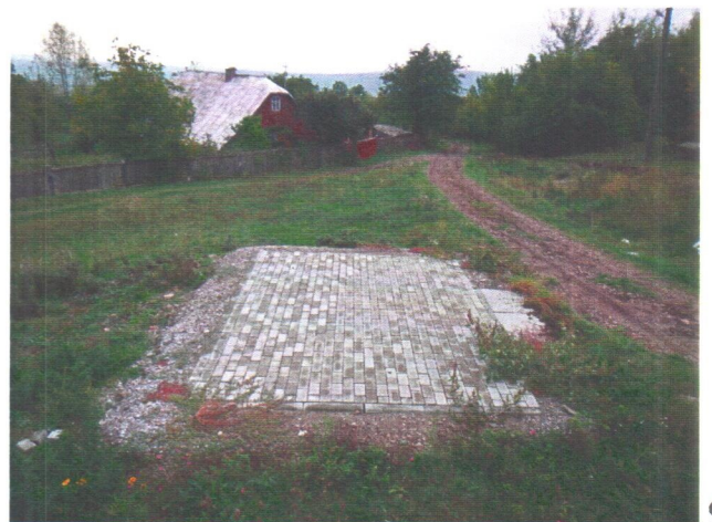
Latitude: N 47°37.475' (47°37'28.5"), Longitude: E 26°2.980' (26°2'58.8"), Altitude (Barometer): 382.00m