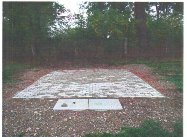
Latitude: N 47°37.113' (47°37'6.8"), Longitude: E 26°2.188' (26°2'11.3"), Altitude (Barometer): 419.00m