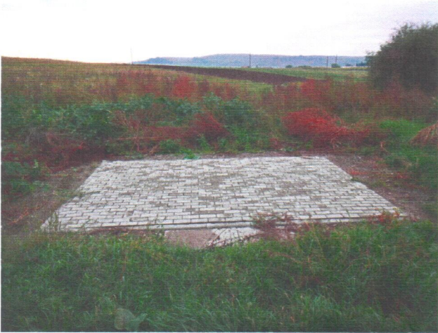
Latitude: N 47°36.873' (47°36'52.4"), Longitude: E 26°3.062' (26°3'3.7"), Altitude (Barometer): 348.00m