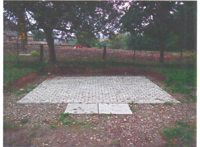
Latitude: N 47°37.343' (47°37'20.6"), Longitude: E 26°3.591' (26°3'35.5"), Altitude (Barometer): 325.00m