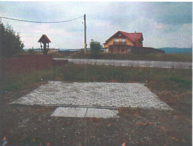
Latitude: N 47°36.417' (47°36'25.0"), Longitude: E 26°1.357' (26°1'21.4"), Altitude (Barometer): 445.00m