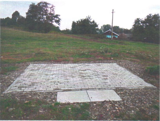
Latitude: N 47°37.296' (47°37'17.8"), Longitude: E 26°2.499' (26°2'30.0"), Altitude (Barometer): 393.00m