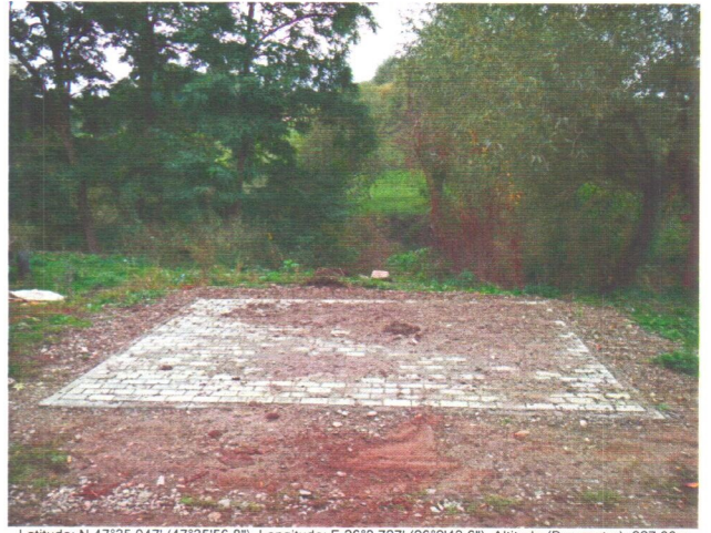
Latitude: N 47°35.947' (47°35'56.8"), Longitude: E 26°2.727' (26°2'43.6"), Altitude (Barometer): 327.00m