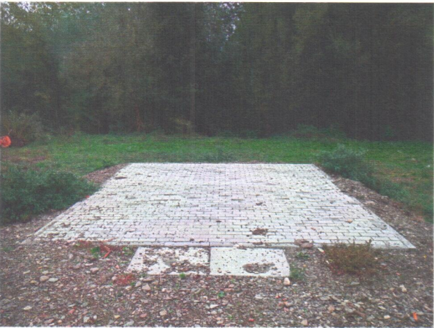
Latitude: N 47°35.982' (47°35'58.9"), Longitude: E 26°3.092' (26°3'5.5"), Altitude (Barometer): 318.00m