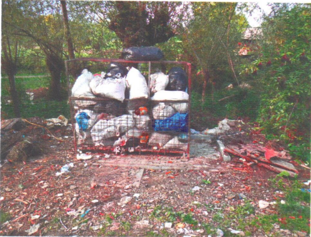
Latitude: N 47°41.330' (47°41'19.8"), Longitude: E 25°56.592' (25°56'35.5"), Altitude (Barometer): 385.00m