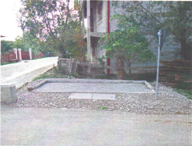
Latitude: N 47°41.511' (47°41'30.7"), Longitude: E 25°55.428' (25°55'25.6"), Altitude (Barometer): 416.00m