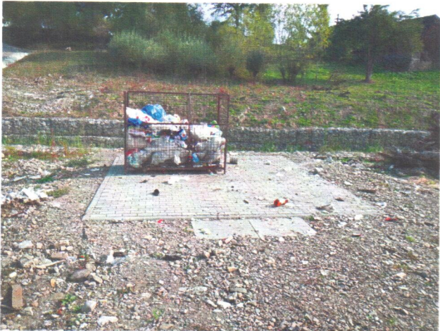
Latitude: N 47°40.818' (47°40'49.1"), Longitude: E 25°56.516' (25°56'31.0"), Altitude (Barometer): 365.00m