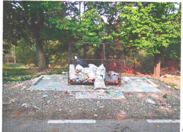
Latitude: N 47°40.643' (47°40'38.6"), Longitude: E 25°56.110' (25°56'6.6"), Altitude (Barometer): 416.00m