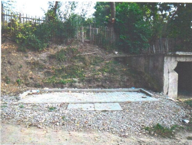
Latitude: N 47°41.042' (47°41'2.5"), Longitude: E 25°56.320' (25°56'19.2"), Altitude (Barometer): 383.00m