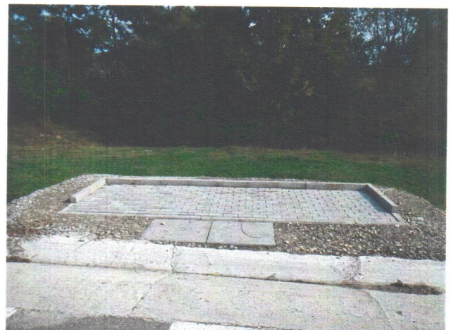
Latitude: N 47°41.202' (47°41'12.1"), Longitude: E 25°55.630' (25°55'37.8"), Altitude (Barometer): 397.00m