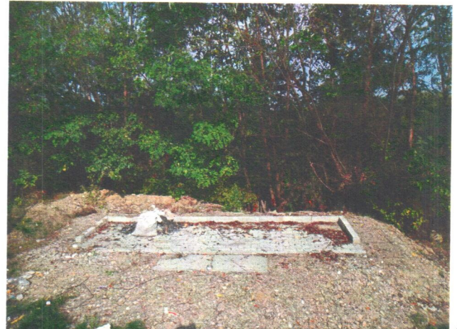
Latitude: N 47°40.837' (47°40'50.2"), Longitude: E 25°55.715' (25°55'42.9"), Altitude (Barometer): 412.00m