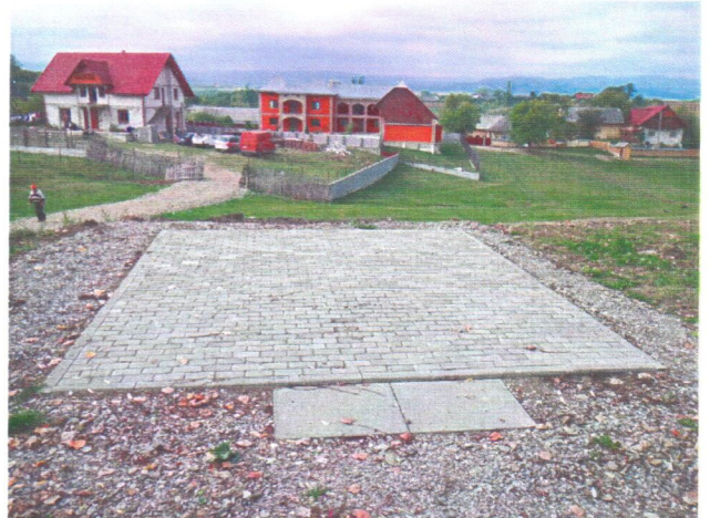
Latitude: N 47°41.748' (47°41'44.9"), Longitude: E 25°56.154' (25°56'9.2"), Altitude (Barometer): 408.00m