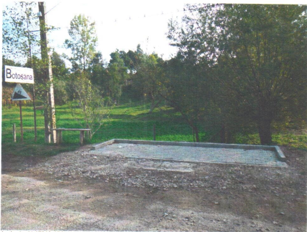
Latitude: N 47°40.176' (47°40'10.6"), Longitude: E 25°55.612' (25°55'36.7"), Altitude (Barometer): 394.00m